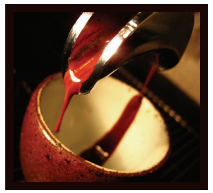
Initial pour must have the correct reddish-brown tinge.

In a café or espresso bar, customers are looking for the espressos and espresso-based milk drinks to taste exactly the way they tasted the last time. In such commercial environments, the café is in the business of fulfilling peoples' expectations. In