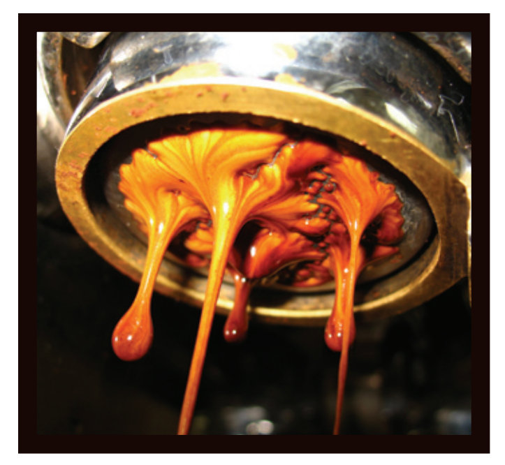
Real Espresso should ooze out of the porta filter like thick, warm, honey.

The emulsified oils responsible for the crema, which is a collection of tiny bubbles with a film of oil on the outside and the coffee's aroma inside, provide this mechanism to hold the aroma of fresh ground coffee in the cup. These aroma molecules, later released when the bubbles burst in the back of one's mouth, find their way to the nose through the pharynx that connects the mouth to the nasal cavity. These tiny bubbles also attach themselves to the taste buds and burst, from time to time, to release the volatile compounds long after the espresso is gone, accounting for the long after-taste, a distinguishing feature of