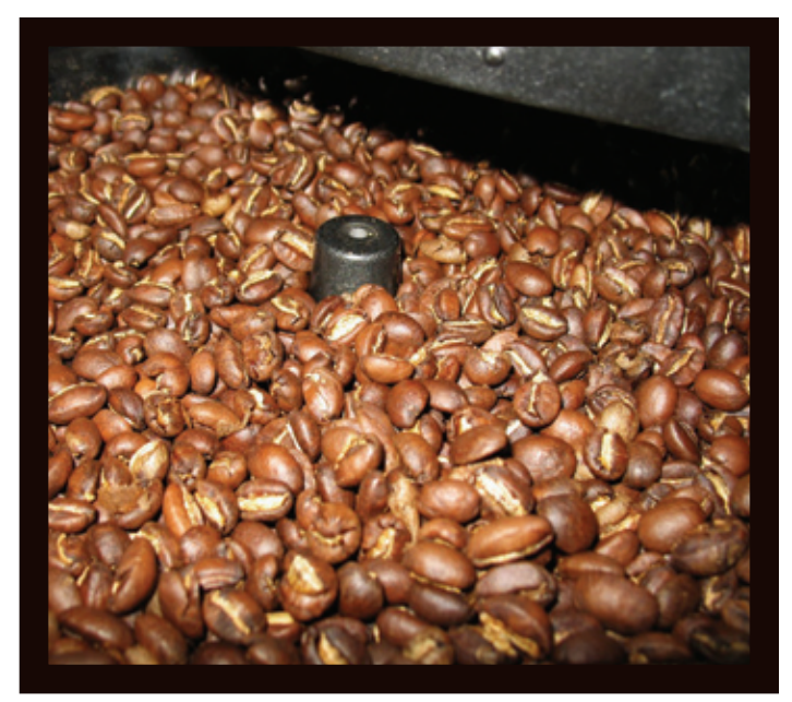
Cooling in the tray.

The sweet, flavorful and desirable components of ground coffee are extremely soluble in water and most of them are easily extracted in a short time or by little water flowing through the ground coffee. Longer contact time, or more water flowing through the