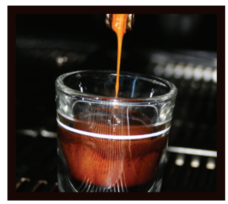
Everything coming out of the portafilter should be crema.

that situation, espresso blend stability as well as shot-to-shot consistency is of paramount importance. In that context, it is inconceivable that one single-origin espresso can fulfill that consistency objective if that is the only espresso offered in a café.